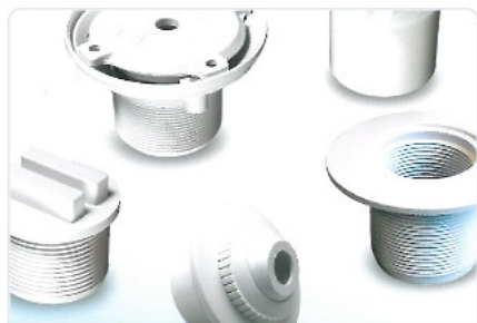
Inlets &amp; Returns