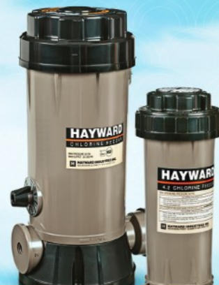
Automatic Chemical Feeders 4.2 – 9 lb