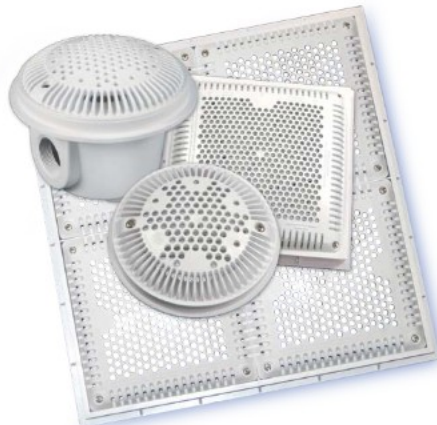
WG-Series Suction Outlets

WG-Series suction outlets, frames & covers — compliant with ASME/ANSI A112.19.8 and the Virginia Graeme Baker Pool & Spa Safety Act.