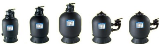
SwimPro® Hi-Rate Sand

Hi-rate sand filtration for crystal-clear water — top and side mount tanks for every pool type, salt water or standard chlorination.