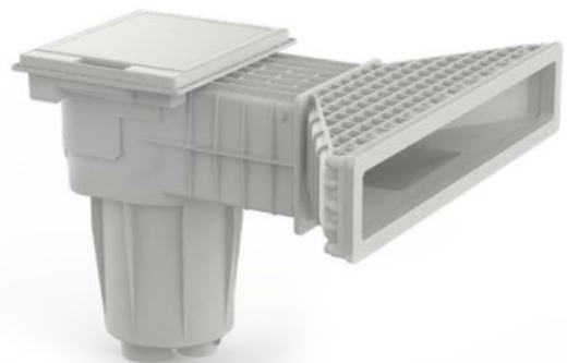
X-Pro 600 CONCRETE · LINER · FIBREGLASS