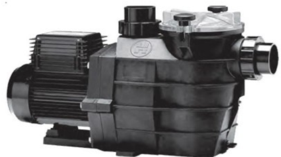
Super II ECO®