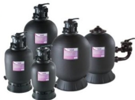
Filters PL — Side & Top