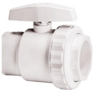
Ball Valves TRIM SERIES

Flow control for every plant room — ball valves, VariFlo™ multiport control valves, and PSV check & diverter valves.