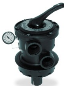
VariFlo™ XL MULTIPORT