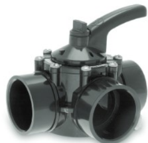
PSV Series CHECK & DIVERTER