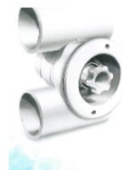
Jet-Air® III Spa