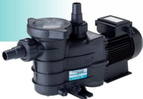
Powerline™ PL Series

Energy-efficient circulation for every pool size — from residential single-speed to variable-speed and commercial-duty pumps.