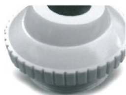
SP-1419B Hydrostream 3/8" ope