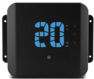
Plug'n Clear Salt Chlorinator 20 – 80 m 3

Effortless salt chlorination — disinfect your pool naturally with a pre-programmed, plug-and-play chlorinator.